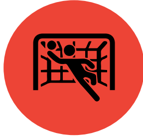
GOALIE PACKAGE UNLIMITED $250