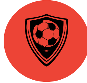
DEFENSE PACKAGE UNLIMITED $500